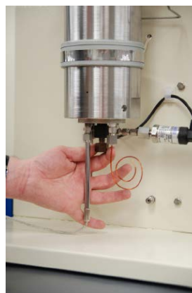
Pressure Relief Device