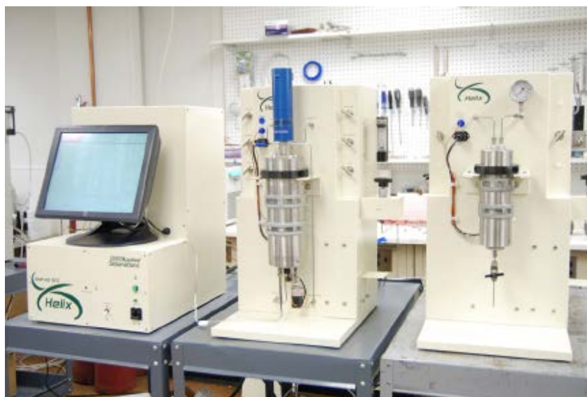
Basic Helix system with the separator module.