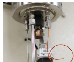
Close-up of the top and bottom vessel ports.