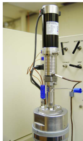
Vessel with Stirrer Assembly