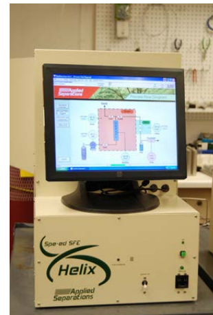
Touchpad System Control